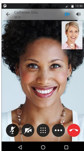
Figure 1. Cisco Jabber for Android (on an Android phone)

Cisco Jabber for Mobile 12.1 streamlines communications and enhances productivity by unifying presence, instant messaging, video, voice, voice messaging, file transfer, and conferencing capabilities securely into one client on a mobile device. The solution delivers highly secure, clear, and reliable communications. It offers flexible deployment models and is built on open standards. You can communicate and collaborate effectively from anywhere you have an Internet connection (Figures 1 and 2).